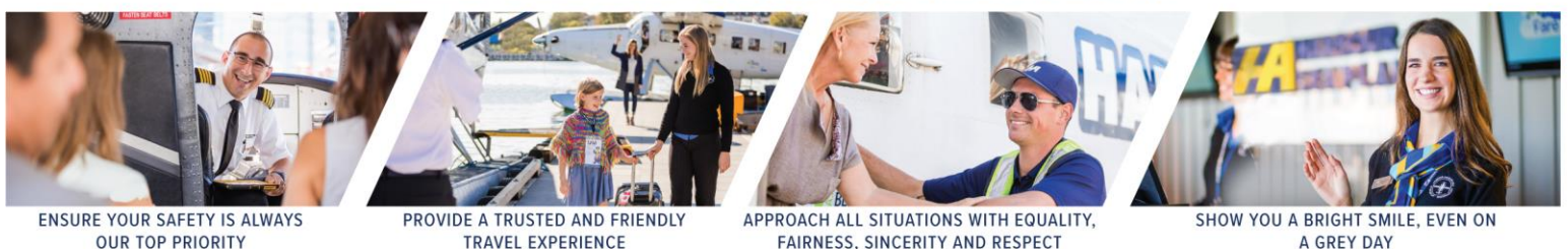
ENSURE YOUR SAFETY IS ALWAYS OUR TOP PRIORITY