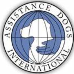
BC & Alberta Guide Dogs